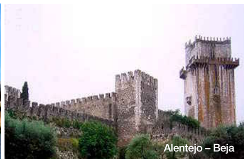
Alentejo – Beja