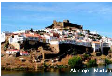
Alentejo – Mértola