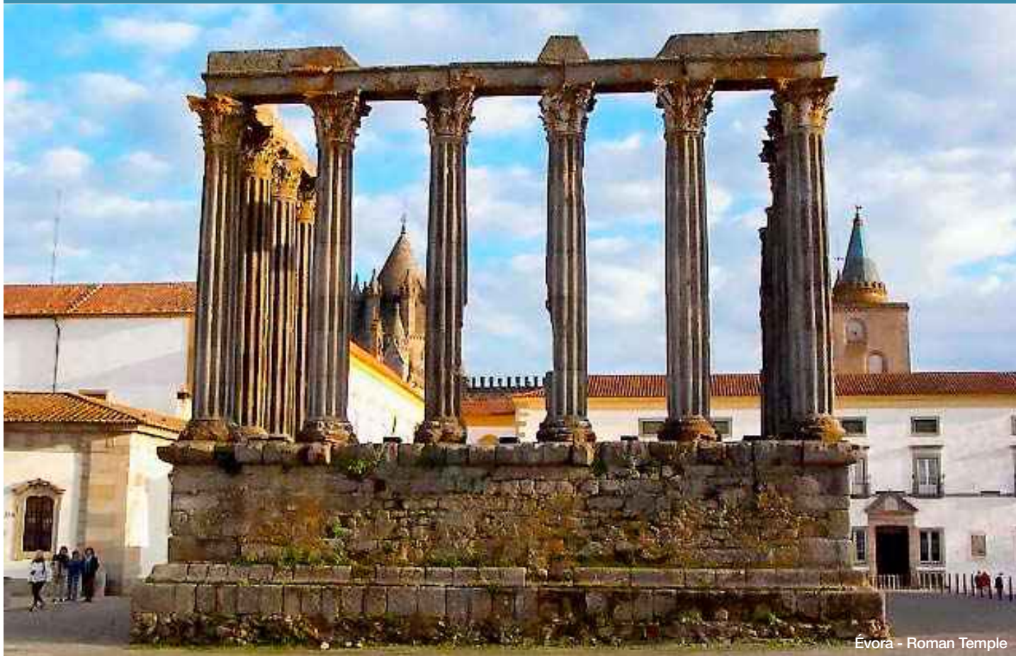
Évora - Roman Temple