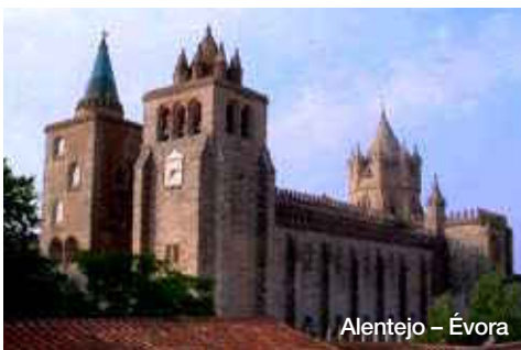
Alentejo – Évora