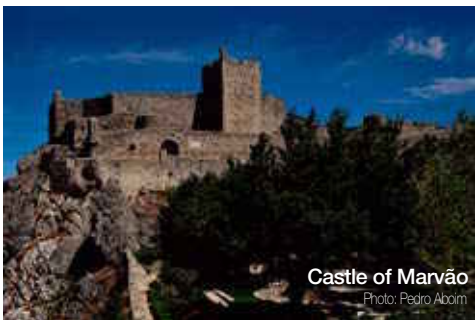
Castle of Marvão