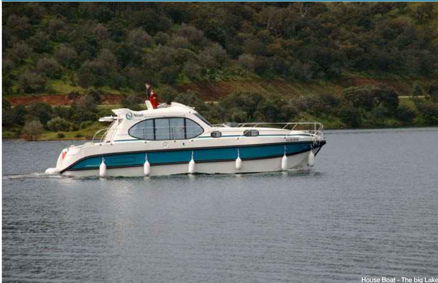
House Boat - The big Lake